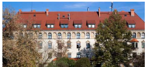
Academic Center of Dentistry Bytom