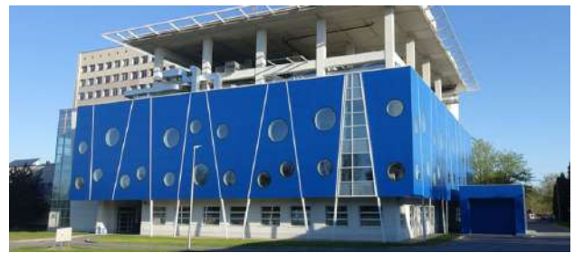
GCM im. L. Gieca Katowice