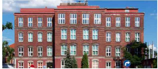
SPSK im. A. Mielęckiego Katowice