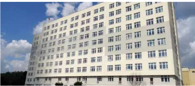
GCZD św. Jana Pawła II Katowice