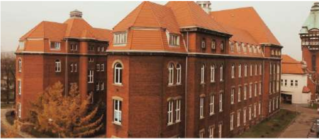
SPSK im. S. Szyszko Zabrze