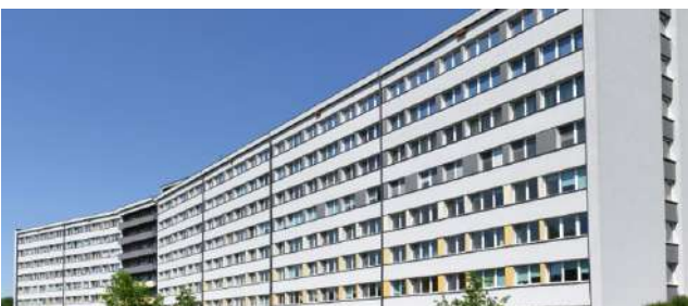
UCK im. K. Gibińskiego Katowice