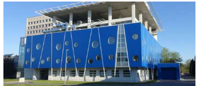
GCM im. L. Gieca Katowice