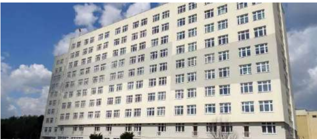
GCZD św. Jana Pawła II Katowice