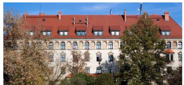
Academic Center of Dentistry Bytom