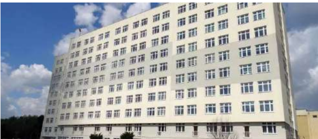
GCZD św. Jana Pawła II Katowice