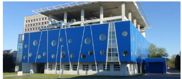
GCM im. L. Gięca Katowice